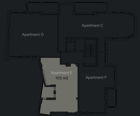
2° PIANO - APPARTAMENTO E